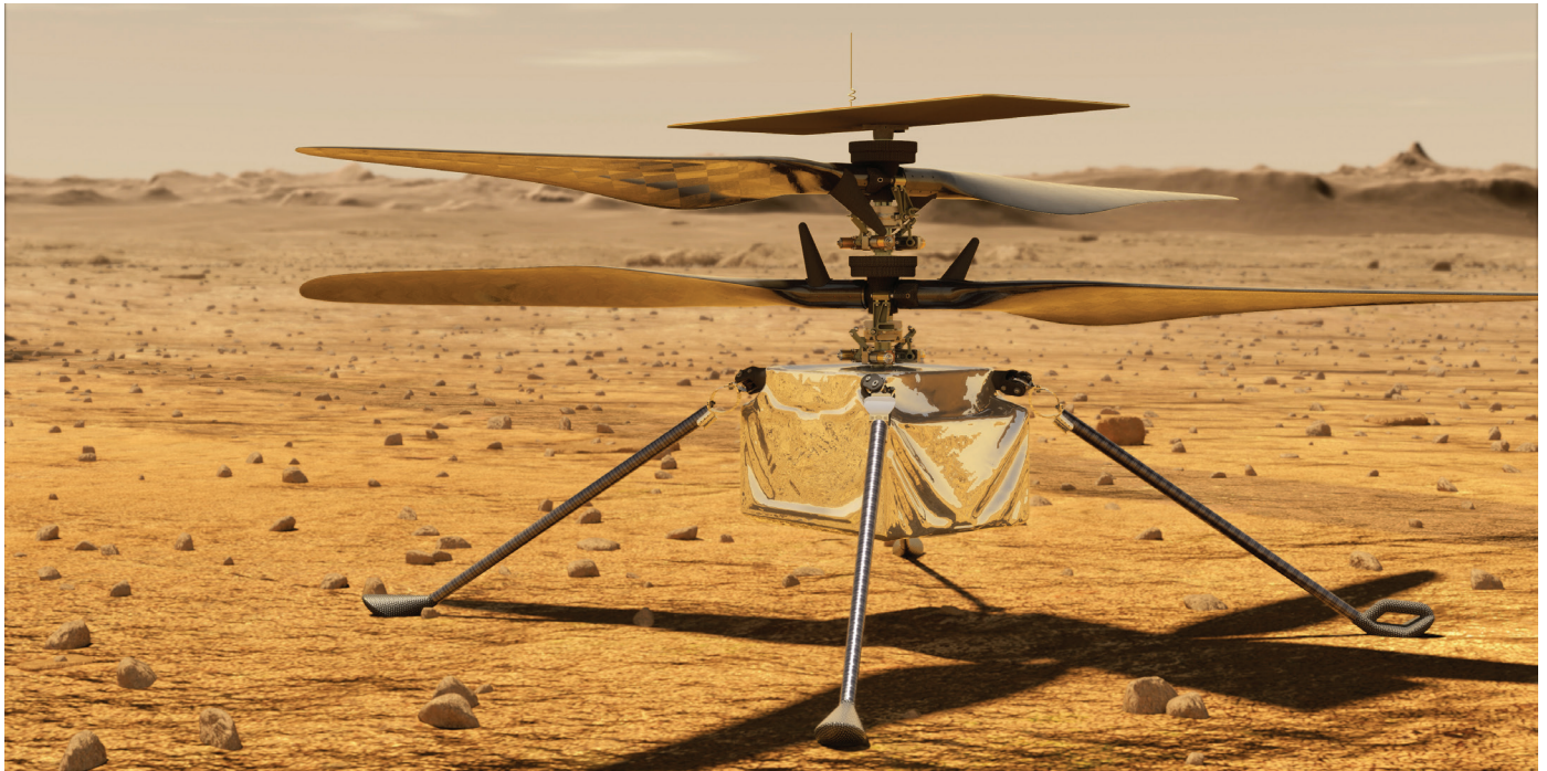
This illustration shows the Mars Helicopter on the surface of Mars.