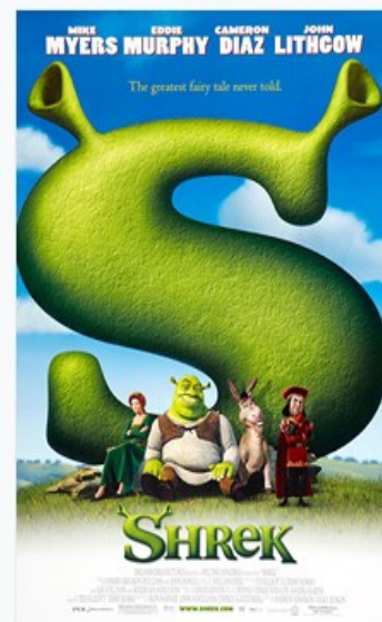
Theatrical release poster