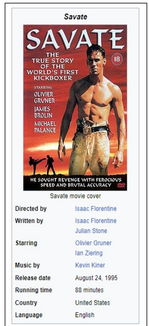
Savate movie cover