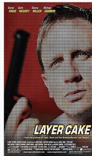
Theatrical release poster