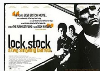
UK theatrical release poster