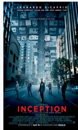
Theatrical release poster