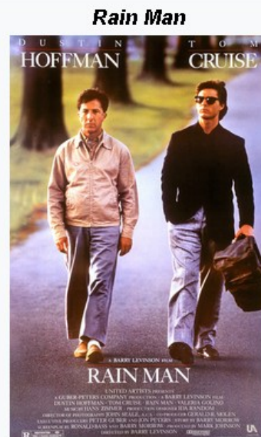
Theatrical release poster by John Alvin

Release Title: Rain Man 03 rd March 1989 (United Kingdom) Origin: United States Release Date 12 th December 1988 (USA NY Prem.) Genres: Drama, Road trip AKA: Also known as: Rain Man Disc Nos. – 1- 1 Certification: 15 Duration: 2h 13 min (86 min) Region Code: 2 Product Code: Languages: English, Italian Filming locations: Santa Ana Regional Transportation Centre - 1000 E. Santa Ana Boulevard, Santa Ana, California, USA (train station) Sound mix: Dolby Stereo, Dolby Digital Colour: Colour Aspect Ratio: 1.85:1 Camera: