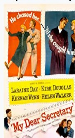
Poster of the film