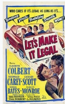
Original film poster