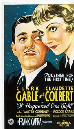
Theatrical release poster