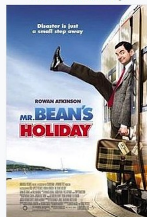
Theatrical release poster