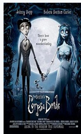
Theatrical release poster