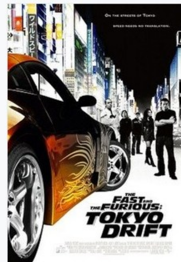
Theatrical release poster