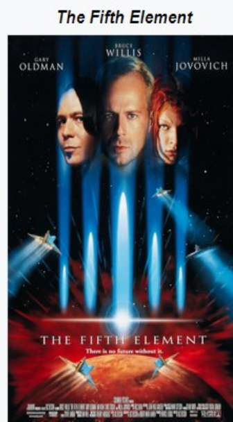
North American theatrical release poster