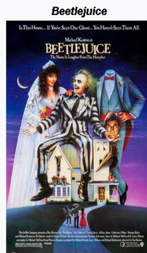
Theatrical release poster by Carl Ramsey