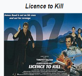
Theatrical release poster by Robin Behling