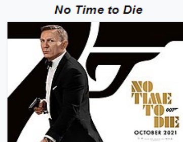
Theatrical release poster