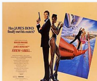
Theatrical release poster by Dan Gouzee