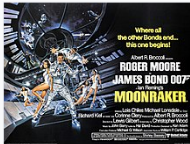
Theatrical release poster by Dan Gouzee