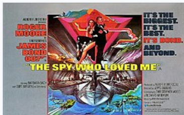
Theatrical release poster by Bob Peak