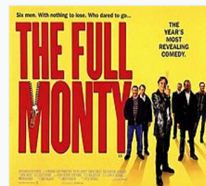
UK theatrical release poster