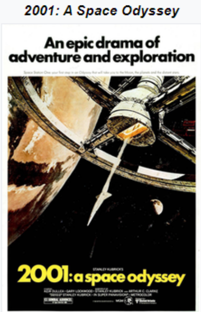
Theatrical release poster by Robert McCall

Release Title: 2001 A Space Odyssey Release date: 1968 (USA) Genre: Adventure, Sci-Fi Disc Nos. - 1 Certification: U Duration: Region Code: Region B Product Code: MPN: EAN: UPC: