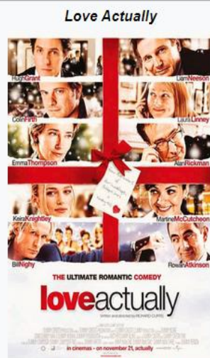
Theatrical release poster