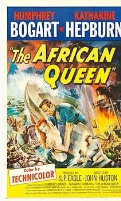
US theatrical release poster