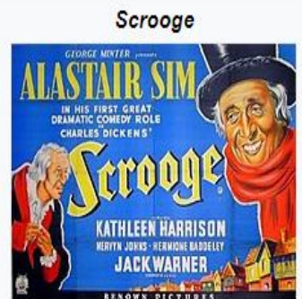
UK quad poster