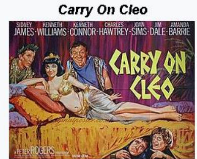
Original UK quad poster