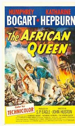
US theatrical release poster