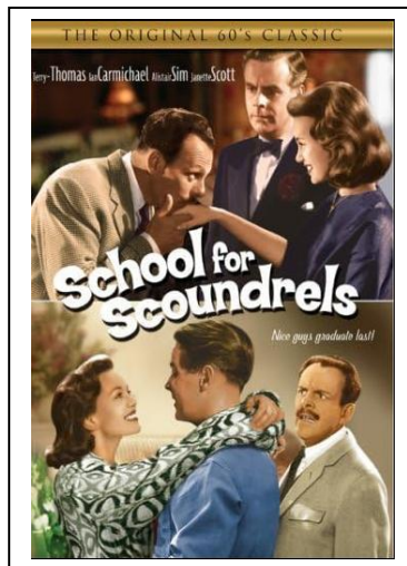
B&amp;W &amp; Colourised Version [Rare]

[2 Discs] B&amp;W &amp; Colourised [Custom]