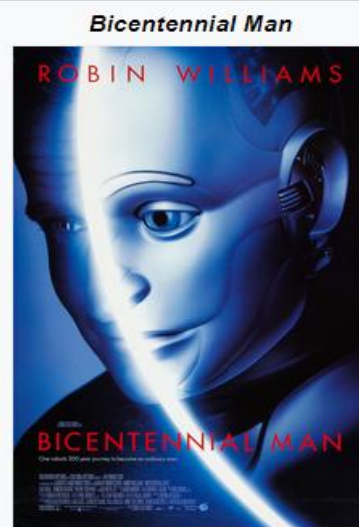
Theatrical release poster