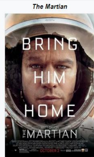
Theatrical release poster