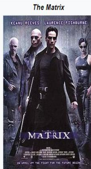
Theatrical release poster