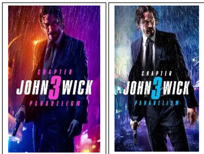
Keanu R. Menu

Motion Picture Rating (MPA) - Rated R for pervasive strong violence, and some language