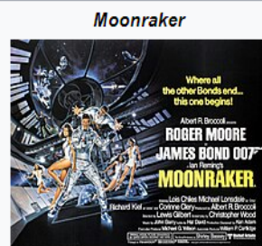
Theatrical release poster by Dan Gouzee