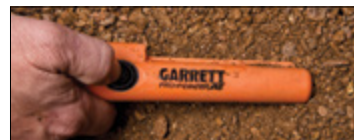
Fast Retune feature quickly tunes out mineralized ground, saltwater, wet sand, and other challenging environments.

If necessary, repeat this Fast Retune to further eliminate any environmental response. Note: An alternate means of eliminating the ground response is to reduce Sensitivity.