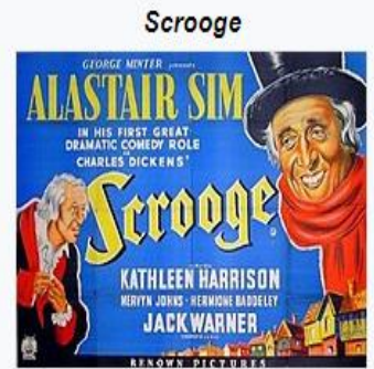
UK quad poster