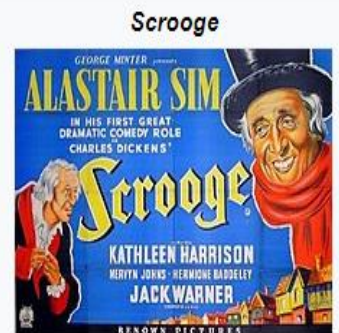
UK quad poster