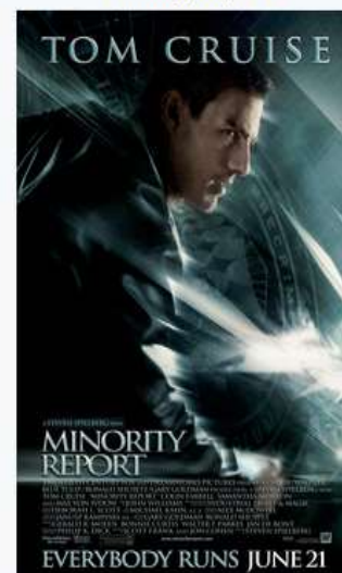
Theatrical release poster