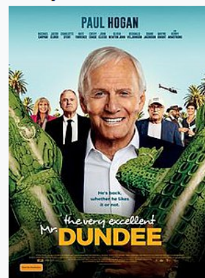
Theatrical release poster