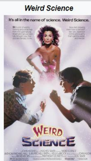
Theatrical release poster by Tom Jung