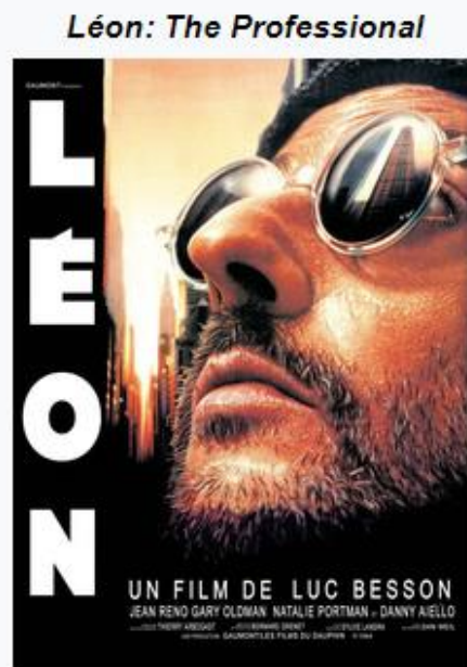
French theatrical release poster