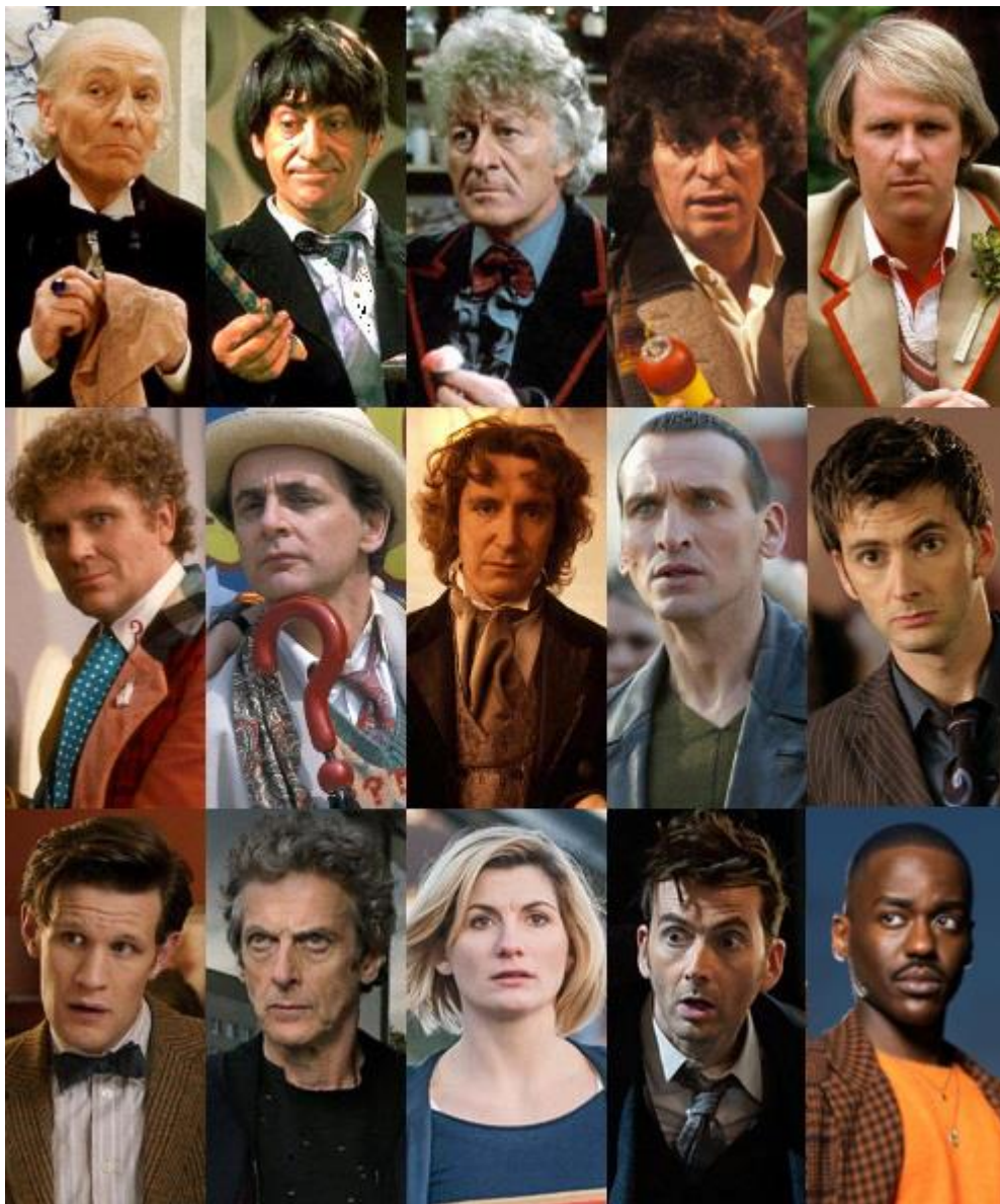
William Hartnell (1963-66) Patrick Troughton (1966-69) Jon Pertwee (1970-74) Tom Baker (1974-81) Peter Davison (1982-84)