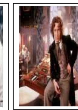
Paul McGann (1996)