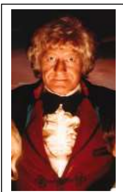
Jon Pertwee (1970-74)