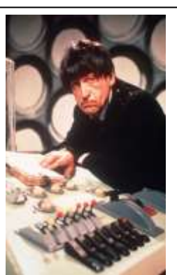
Paterick Troughton (1966-69)