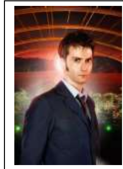
David Tennant (2005-2010)