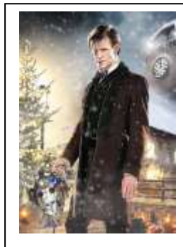
Matt Smith (2010-2013)