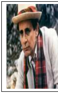
Sylvester McCoy (1987-89)