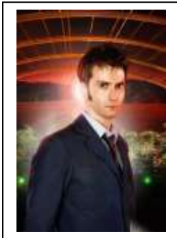
David Tennant (2005-2010)