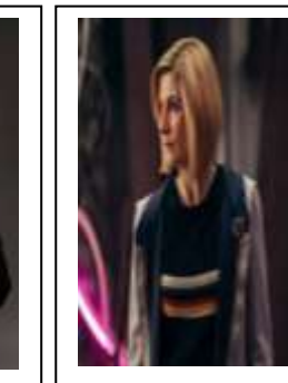
Jodie Whittaker (2018-2022)