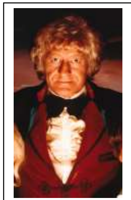
Jon Pertwee (1970-74)