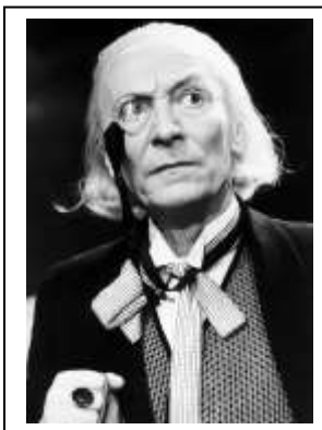
William Hartnell (1963-66)