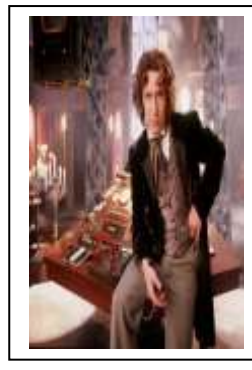
Paul McGann (1996)