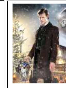
Matt Smith (2010-2013)