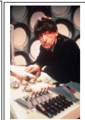
Patrick Troughton (1966-69)