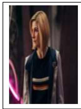
Jodie Whittaker (2018-2022)