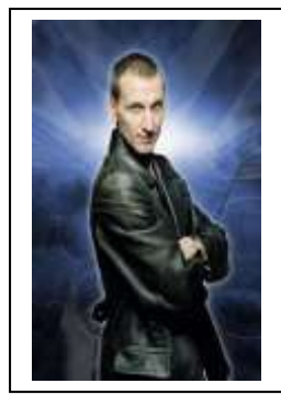
Christopher Eccleston (2005)