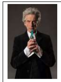
Peter Capaldi (2013-2017)