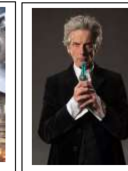
Peter Capaldi (2013-2017)