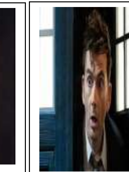
David Tennant (2023)