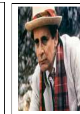
Sylvester McCoy (1987-89)