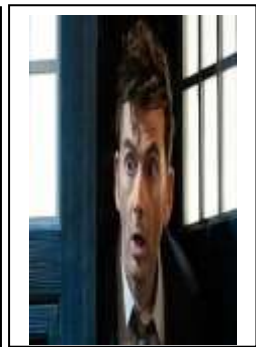
David Tennant (2023)