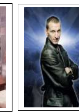
Christopher Eccleston (2005)