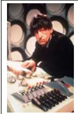
Patrick Troughton (1966-69)