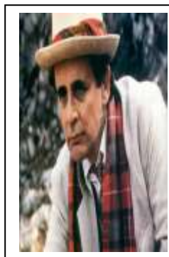
Sylvester McCoy (1987-89)