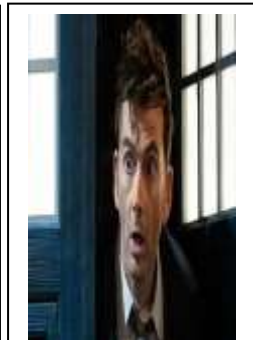
David Tennant (2023)