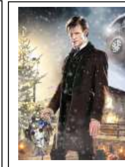
Matt Smith (2010-2013)