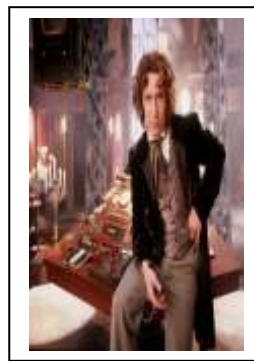
Paul McGann (1996)