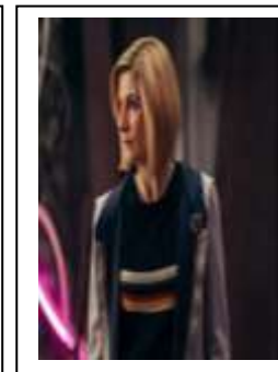
Jodie Whittaker (2018-2022)