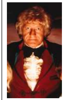
Jon Pertwee (1970-74)