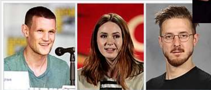
Matt Smith, Karen Gillan and Arthur Darvill return for the sixth series