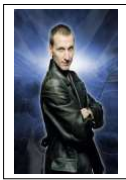
Christopher Eccleston (2005)