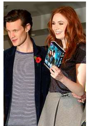
Matt Smith was cast as the Eleventh Doctor and Karen Gillan was cast as his companion, Amy Pond.