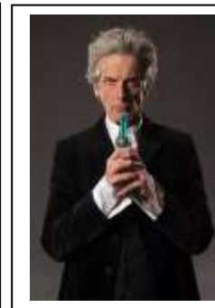
Peter Capaldi (2013-2017)