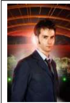
David Tennant (2005-2010)