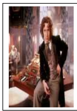
Paul McGann (1996)