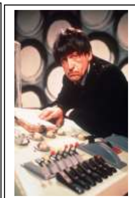
Paterick Troughton (1966-69)