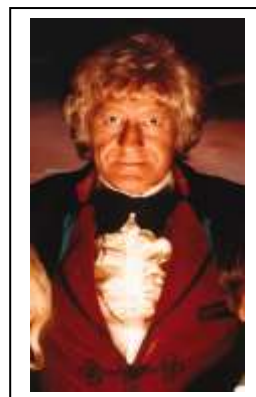
Jon Pertwee (1970-74)