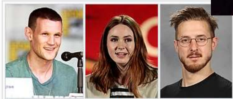
Matt Smith, Karen Gillan and Arthur Darvill return for the sixth series