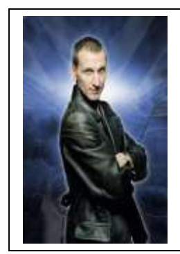
Christoper Eccleston (2005)