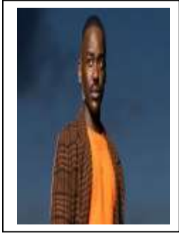
Ncuti Gatwa (2024-)