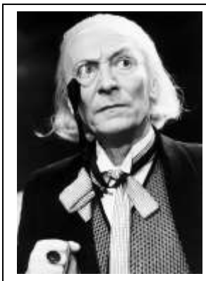
William Hartnell (1963-66)