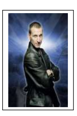
Christoper Eccleston (2005)