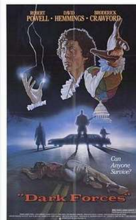
Theatrical film poster under alternate title