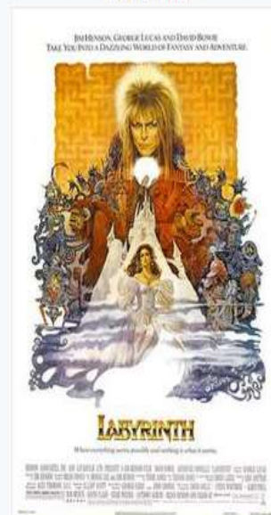
Theatrical release poster by Ted CoConis