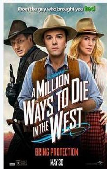
Theatrical release poster