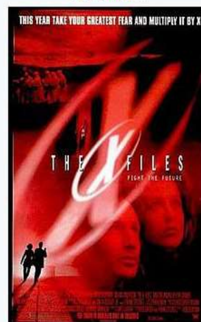
Theatrical release poster