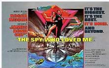
Theatrical release poster by Bob Peak