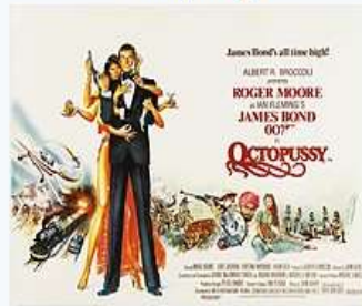
Theatrical release poster by Dan Goozee and Renato Casaro