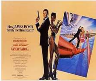
Theatrical release poster by Dan Gouzee