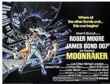
Theatrical release poster by Dan Gouzee