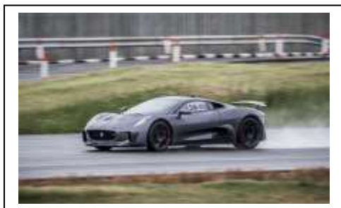
After being cancelled in 2012, the Jaguar C-X75 was recommissioned to appear in Spectre.

MPAA Rated PG-13 for intense sequences of action and violence, some disturbing images, sensuality and language.