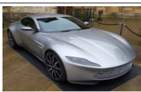
The Aston Martin DB10 is driven by Bond in The Film.