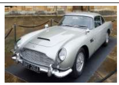
The Aston Martin DB5 reappears after reconstruction in Q's Workshop at the Film's ending, with Bond driving away With it.