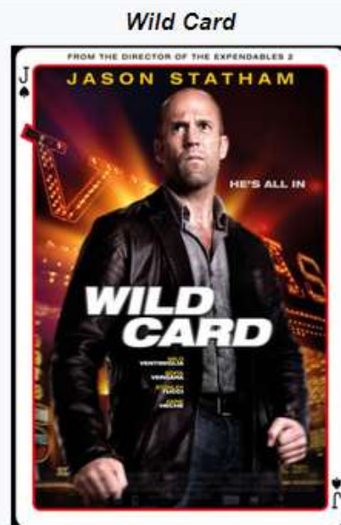
Theatrical release poster