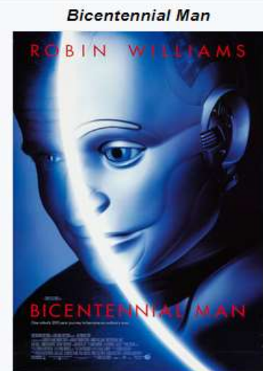
Theatrical release poster